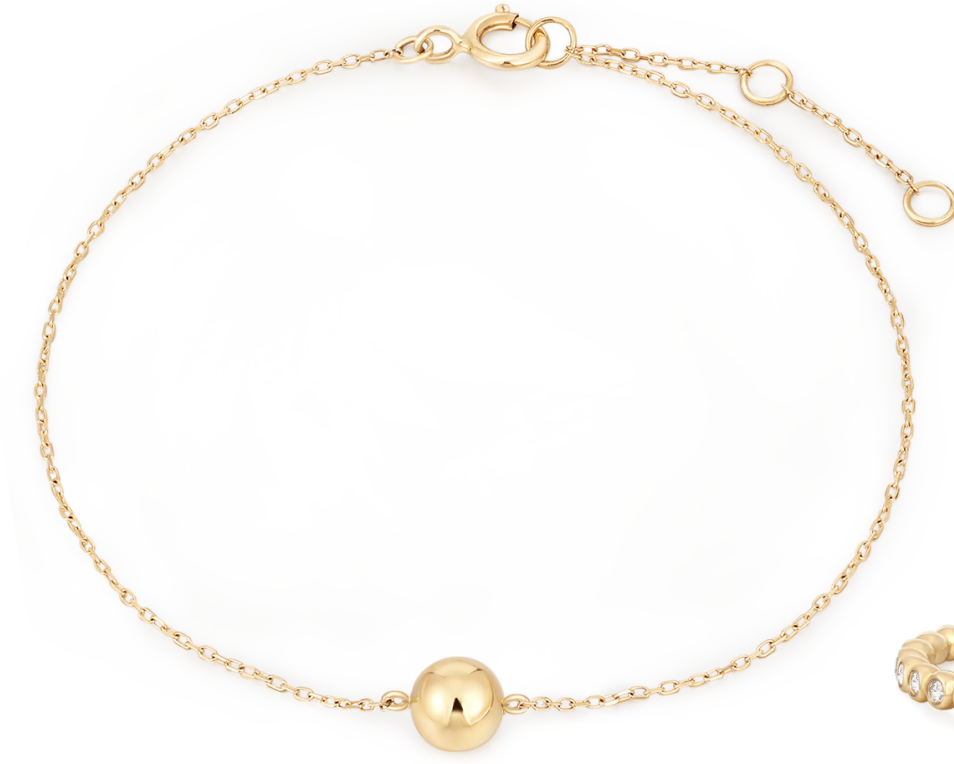
GBKF2953-G 14K Gold