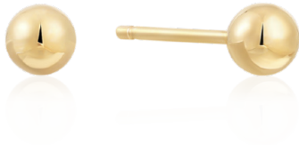
GEKF2891-G 14K Gold