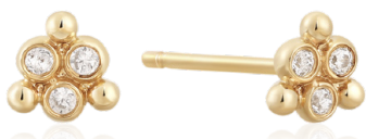
GEKF2890-DA-G 14K Gold、Diamond