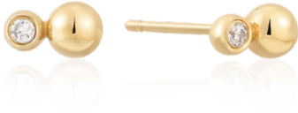
GEKF2887-DA-G 14K Gold、Diamond