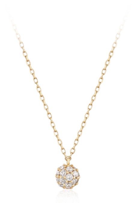
GNKF2954-DA-G 14K Gold、Diamond