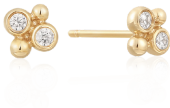
GEKF2888-DA-G 14K Gold、Diamond