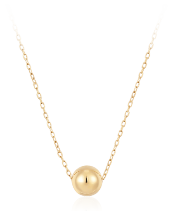
GNKF2952-G 14K Gold