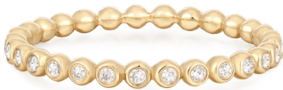
GRKF2956-DA-G-#7 14K Gold、Diamond